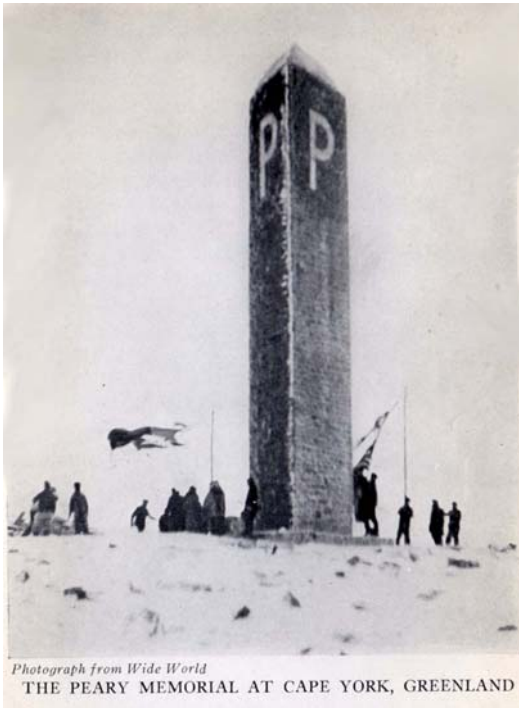
THE PEARY MEMORIAL AT CAPE YORK, GREENLAND